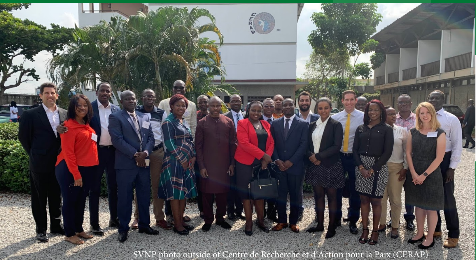
SVNP photo outside of Centre de Recherche et d'Action pour la Paix (CERAP)

Report on the 2019 Southern Voices Network for Peacebuilding Annual Conference